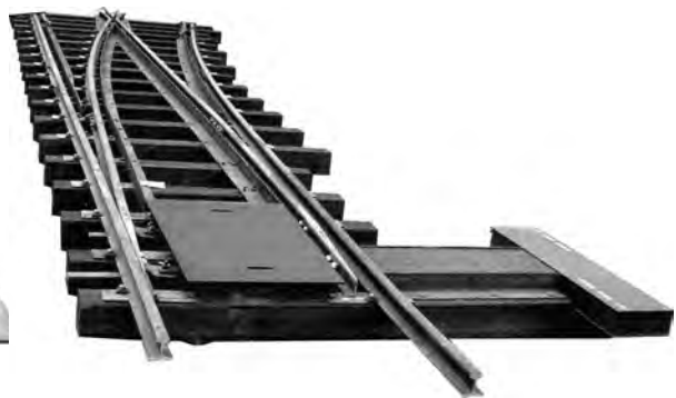
Right-Hand Pavement Turnout